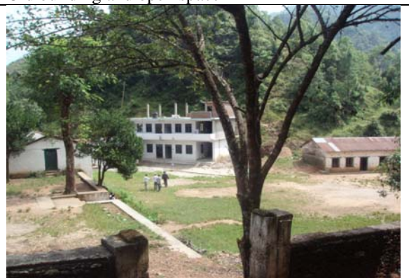
New building seen in the picture