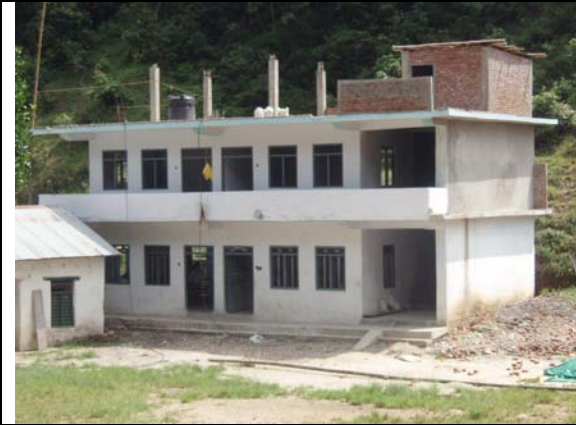
New Building close view