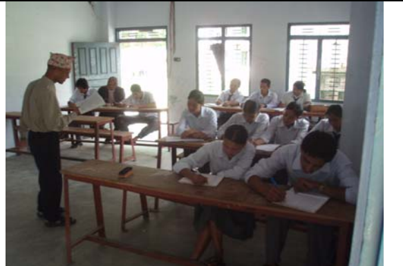
Class going on in new class room with new furniture