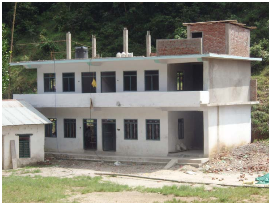
Newly constructed building

The Excom received the final report from School management as per the agreement and from Alumini. The final report about the HUNSA donation was presented on the GA held on 22 nd of December 2007 for the final approval. The GA passed with great acknowledgments to the Excom, Alumini and the individuals who directly or indirectly help to achieve this milestone on HUNSA history.