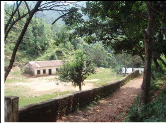
Old building of Shitala Ma Vi