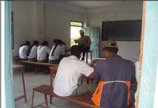
Class going on in new class room with new furniture