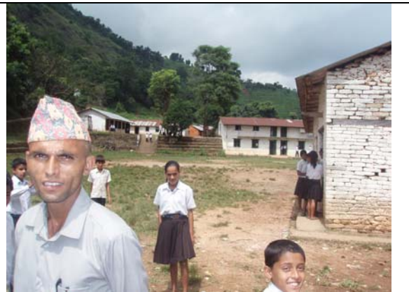
Old building and open space