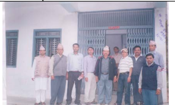
School construction committee people posing photo in front of channel gate constructed by Hunsa Fund