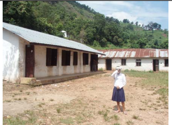
Old Infrastructures of Shitala Ma Vi