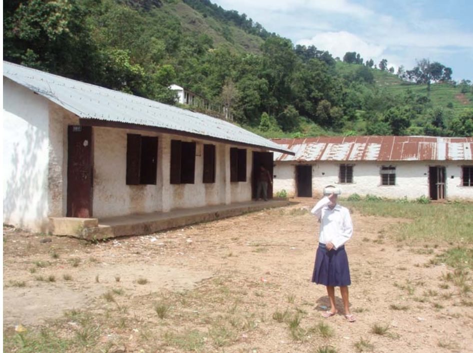
Photo showing old infrastructures of the school

With the initiation of HUNSA Excom 2007, part of the long time deposited HUNSA fund was supported to the rural education upliftment in Nepal. The executive body called the proposal as soon as the assumption of office on January 2007. Half yearly GA of HUNSA held on July 2007 passed the proposal of Shitala Madyamik Vidhyalaya, Syangja among the two proposals received. The passed proposal was about the partial support for the remaining construction works and arrangement of furniture for the newly constructed building of Sitala Madhyamik Bidhyalaya, Pauwai Gaunde , Syangja, Nepal.