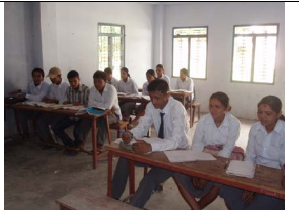
Class going on in new class room with new furniture