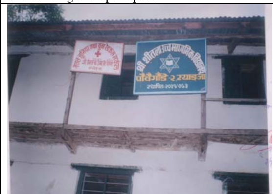
School Building with name plate