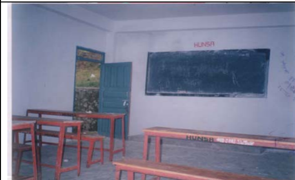
Furniture in the new building purchased from Hunsa support