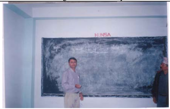
New Marker board in the classroom purchased with Hunsa fund