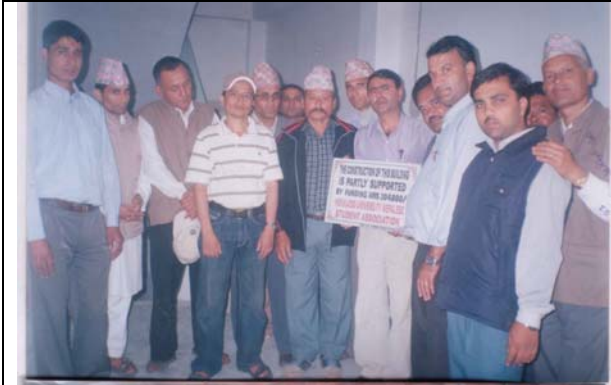
Construction committee posing photo with Hunsa appreciation board